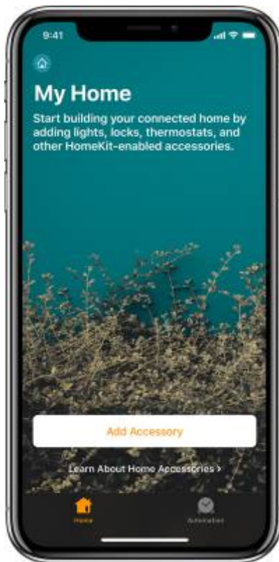
Figure 4: Homekit Application