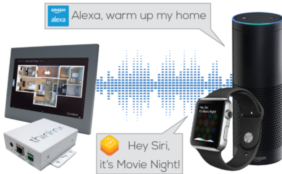
Figure 1: Voice Control with Thinknx

This object allows you to control the house by sending voice commands to your voice enabled device. Integration can be done via: